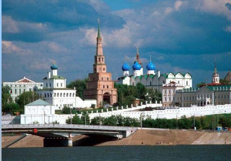
Soyembike Tower-the most famous building of Kazan