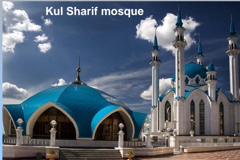
Kul Sharif mosque