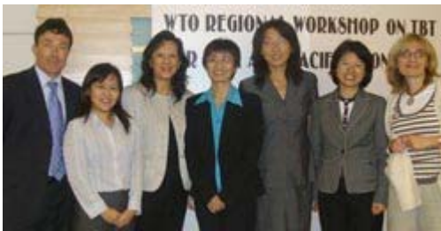
Attendees at the WTO workshop

During an open discussion forum held on the last day, attendees were invited to raise issues for further consideration by the WTO or other invited organizations, including the IEC. Delegates from Bhutan and India raised the need for further assistance in raising the region's awareness and understanding of conformity assessment across various disciplines. During the discussions, attendees were informed of work through the IEC Affiliate Country Programme, now boasting 77 participating countries and the coordinated work between the Programme's secretariat and its three conformity assessment schemes ( IECEE , IECQ and IECEX ).