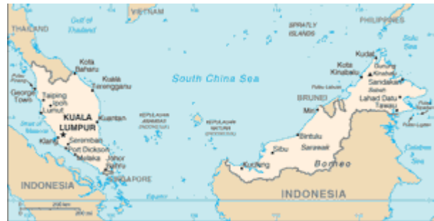
26 countries from the Asia-Pacific Region took part in the WTO workshop

The event also enabled attendees to gain a better understanding and updates from the activities of the invited organizations, with the IEC providing examples of practical and real benefits in the use of its standards and its conformity assessment schemes.